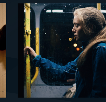
TRANSPORT HAND RAILS